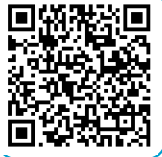
STI and HIV prevention 1-pager