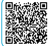
Birth Control 1-pager available in 7 languages